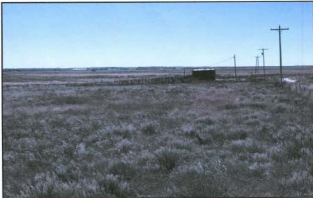
Figure 4. Stable, corrals, and trenches over known Paleoindian cultural materials, view to south.