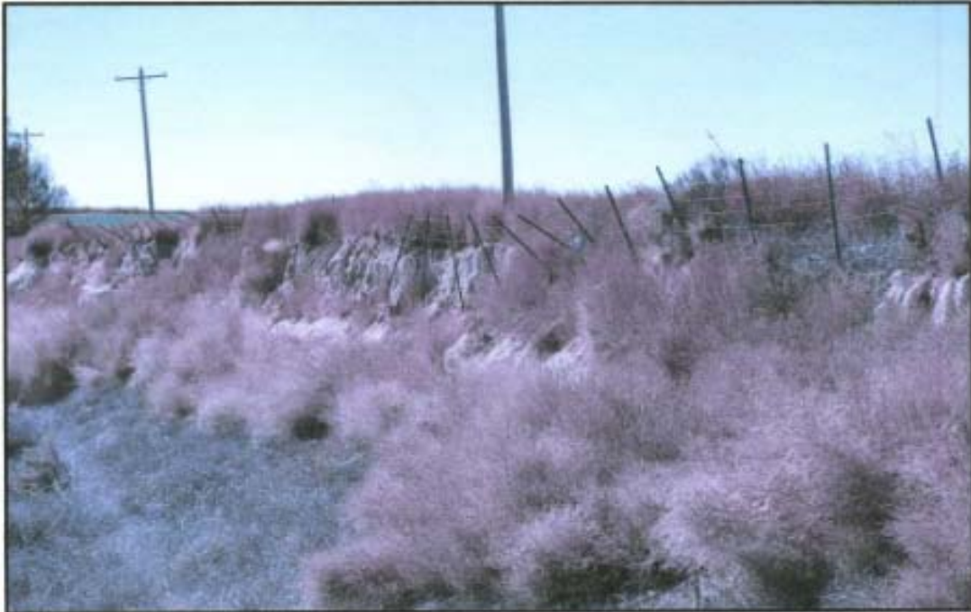
Figure 1. Erosional damage, view to southwest.