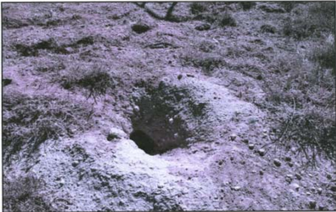
Figure 2. Active prairie dog damage.