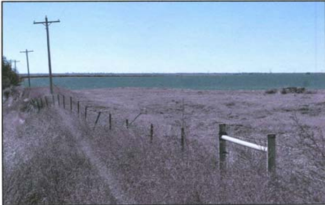
Figure 3. Erosional slumping and fence collapse, view to southwest.